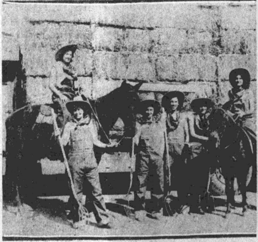
Girls Catch Spirit of Fiesta