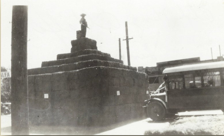
1934 Alfalfa King